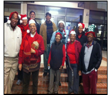
COLA/Gives members gather to distribute Christmas Food Baskets to families in the Richland 1 School District.